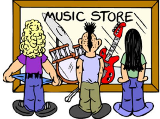
3 Do you like window shopping? Why?