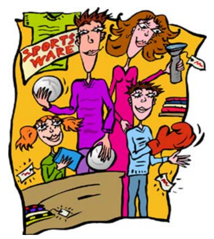
4. What's your favorite department?