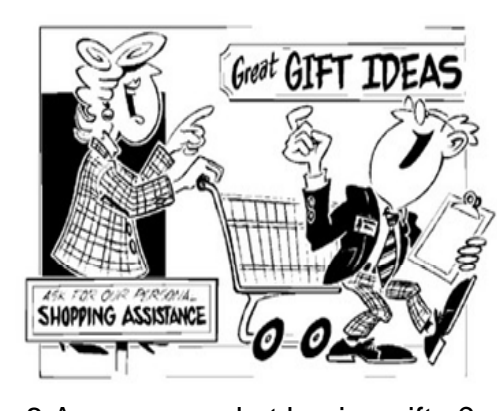
8 Are you good at buying gifts?