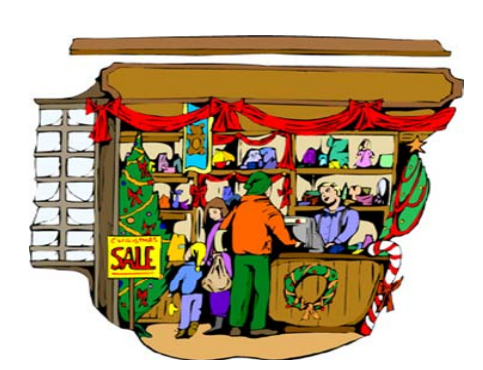
9 Do you go to sales?

Label the pictures with the vocabulary below and then ask & answer questions with a partner.