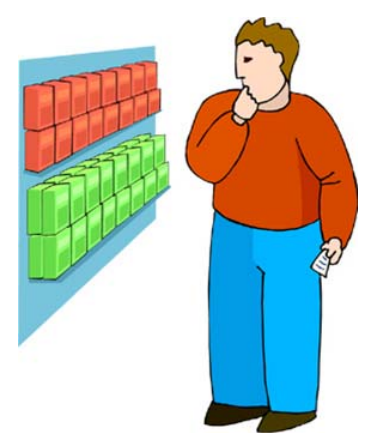
5. Is it difficult for you to choose what to buy? Why?