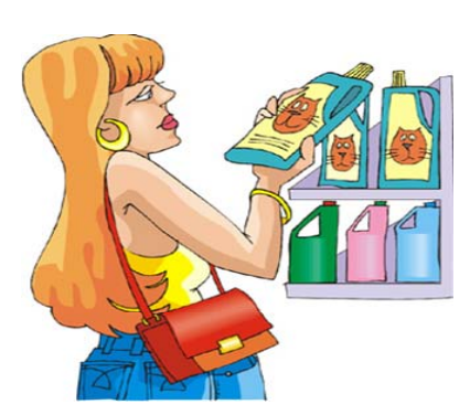
2. Why do read the labels on products?