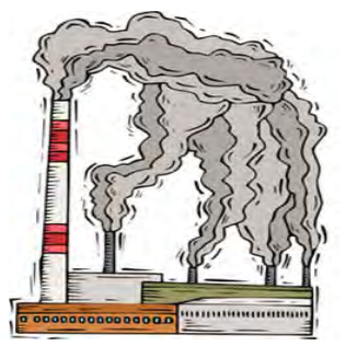
There is a lot of _____ pollution from the factories.