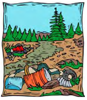
There is too much _____