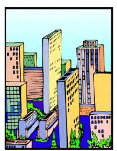
We have a lot of _____ skyscrapers