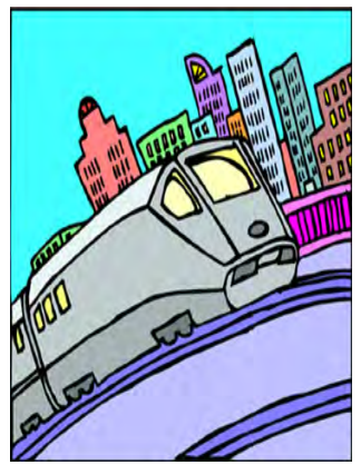
The _____ Is very good.